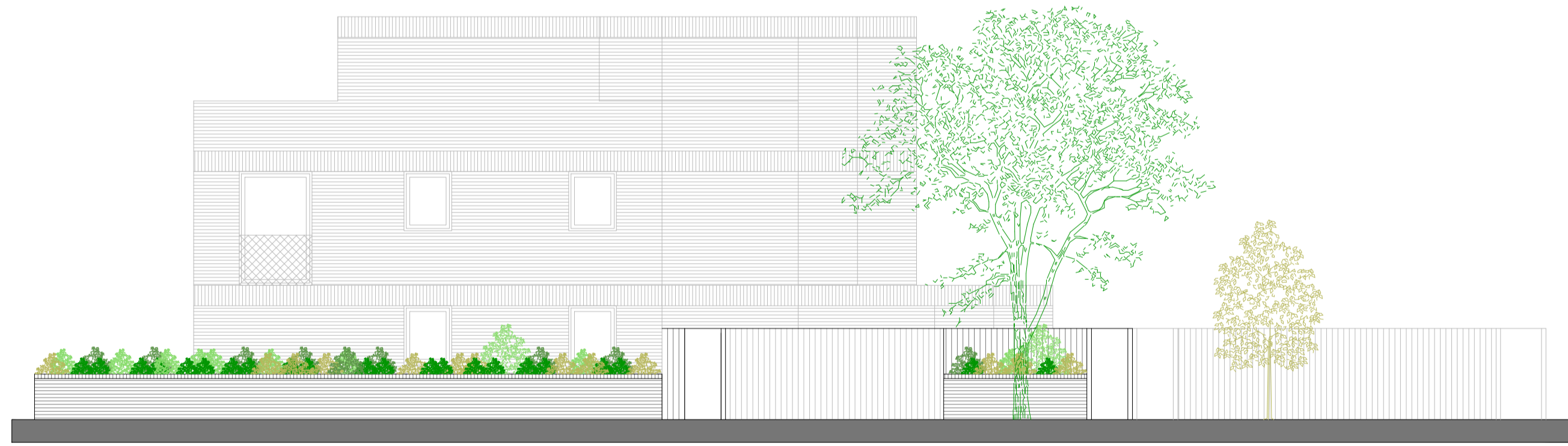
Proposed Side Street Scene with Planting - 1:100